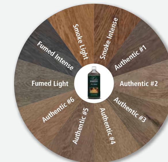
The colors shown are on White Oak and are for reference only and are not binding.

Rubio® Monocoat Pre-Aging is a high-quality, non-reactive pre-treatment, that gives wood an aged appearance. Application provides a deep color with subtle accents. Available in 10 shades, the color spectrum ranges from a lighter to a darker smoked look, with colors that can be mixed with each other to create custom looks.